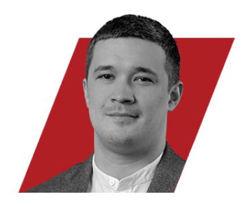
MYKHAILO FEDOROV Vice Prime Minister and Minister of Digital Transformation of Ukraine